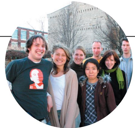
Some members of the GRAND HOUSE, outside the new University of Waterloo School of Architecture.