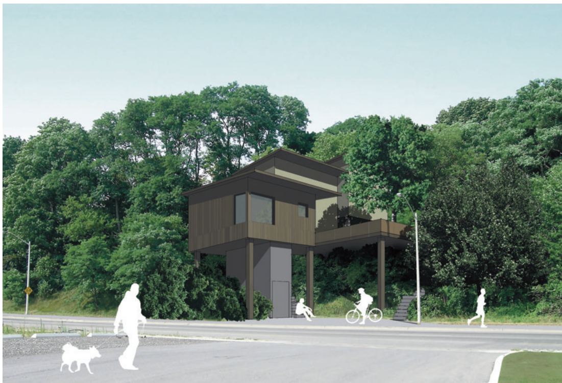
Artists' Rendering of the GRAND HOUSE Ten-Bedroom Student Residence . The building will be located along Ainslie Street North in downtown Cambridge.